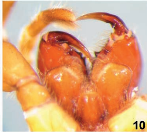
8-10. P. caledoniensis sp. n. female: 8. dorsal view, scale 1.00 mm; 9. cephalothorax, antero-lateral view; 10. cheliceral dentition